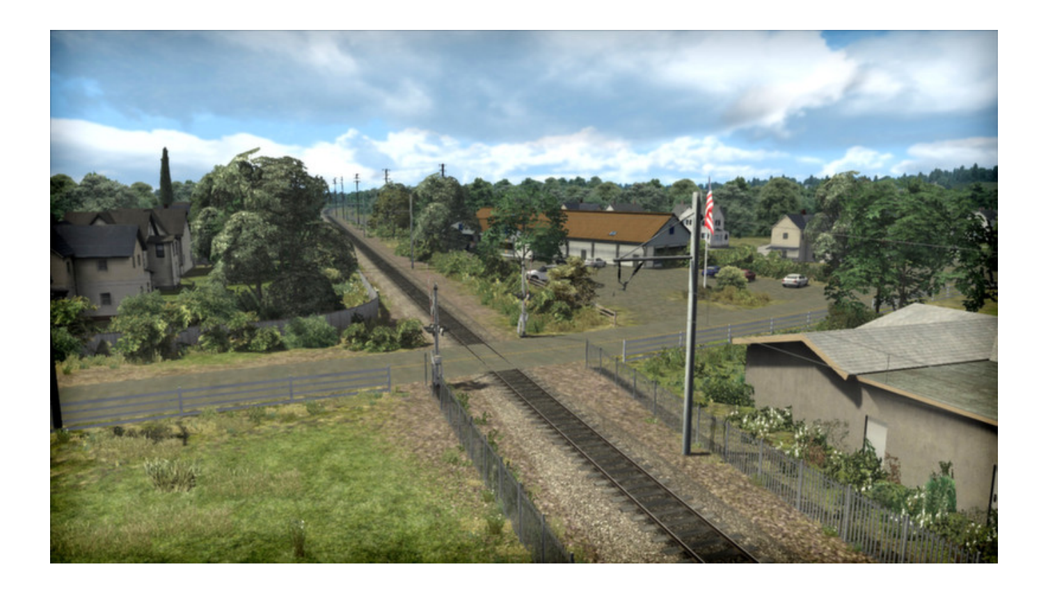
Download >>> <a href="http://bit.lv/2SVqdkB">http://bit.lv/2SVqdkB</a>

Train Simulator: NEC: New York-New Haven Route Add-On Torrent Download